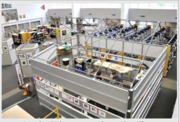
Amazing Makerspace at a Connecticut Library

While the industry's attention of the education market was somewhat successful, and any 3D printer is going to dramatically enhance a classroom environment, many higher education libraries who already had makerspaces and printing labs were beginning to discover the limitations of most desktop 3D printers. When 3D printer manufacturers talk about positioning their printers into educational environments they often lump classrooms and libraries together. On some level it makes sense; after all, both environments seek to serve similar purposes, so it is easy to understand why companies typically don't treat them as different markets.